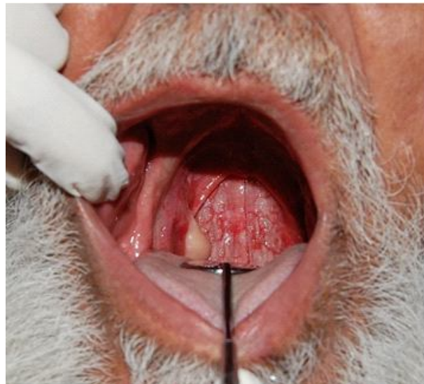
Fig. 1: Preoperative photograph showing the growth in the right tonsillar area.

Excisional biopsy (Fig-2) was done under local anaesthesia & the specimen was sent for histopathological examination (Fig-3) which revealed the structure of fibroma. Patient was recalled after 1wk for the follow up (Fig-4).